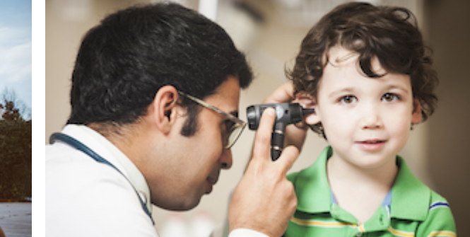
Walk in for summer injury care <u>Learn more</u>