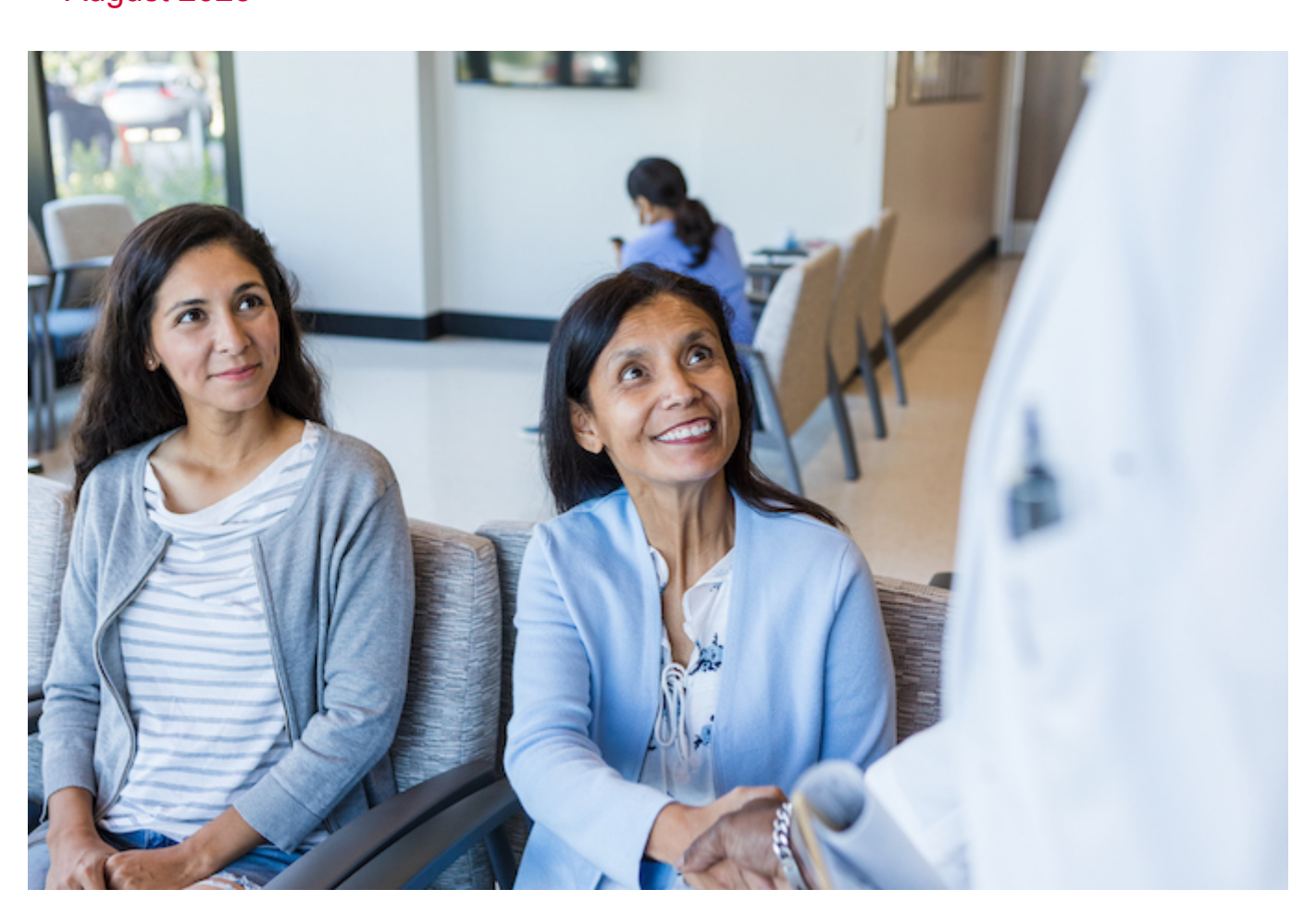
When to go to urgent care vs. the emergency room

Illnesses and accidents can happen at any time. But there is no need to rush to the emergency room when your issue can be diagnosed and treated at CityMD. From unexpected injuries to pesky infections, our physicians are ready to provide you with fast and reliable care when you need it most.