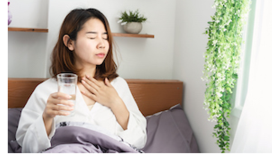
Sore throat relief <u>Learn more</u>