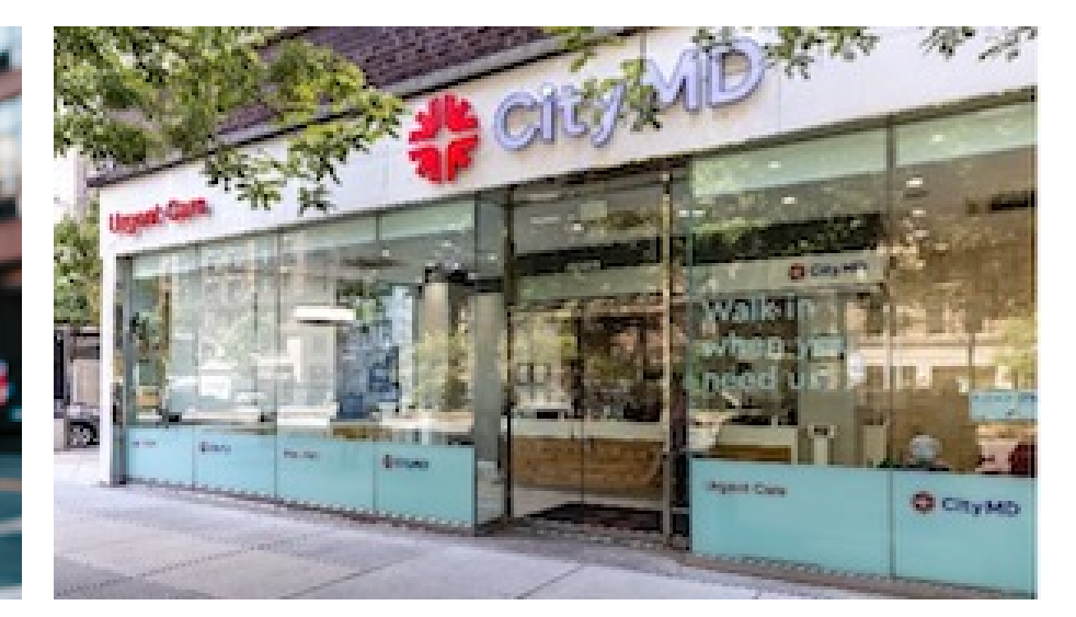
Summit + CityMD app