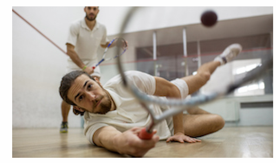
The scoop on overuse injuries