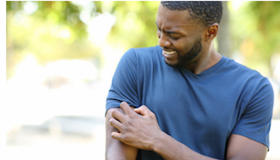
Can stress give you a rash?