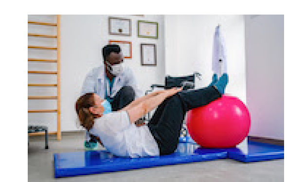
Physical Therapy for Chronic Pain: How it Can Help