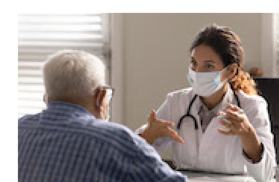
Primary Care Providers: The Key to Healthy Aging