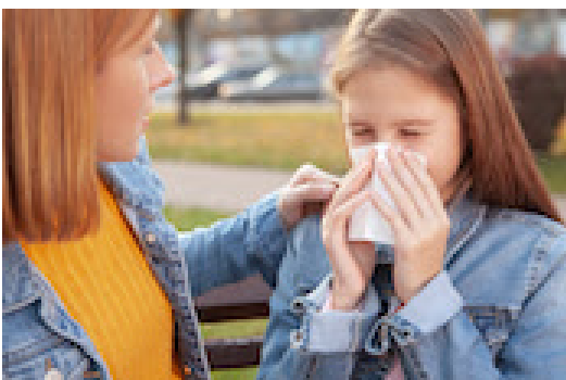
How to Get Through the Fall Allergy Season