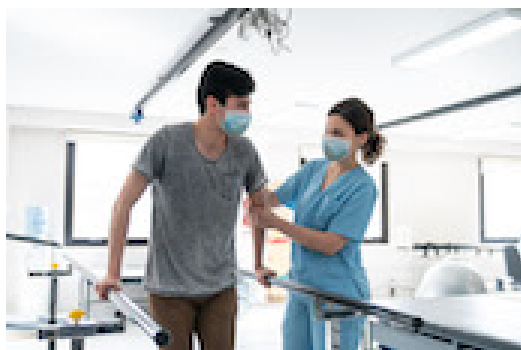
The Importance of Physical Therapy