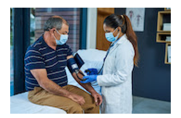
12 Health Topics Covered at Your Physical